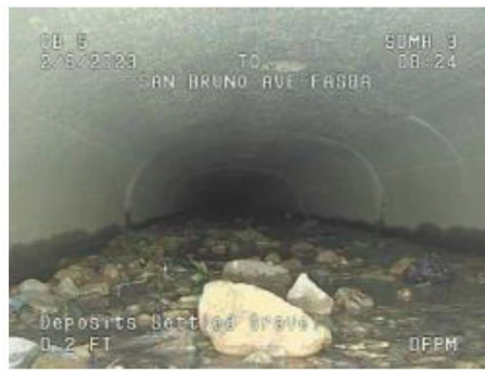
Picture of a Brisbane storm drain, depicting debris that need removal

The cost of such an endeavor? $1.7 million. Couple this amount with a projected $1.9 million budget deficit, not including the work to clear out the drains, and the city is in a tight spot financially. The city council directed staff to create a list of expenditures to delay for six months when we can conduct a mid year budget review. At that time, we will better understand how the city fares financially and can move forward with items on the hold list if possible. Roughly $500,000 worth of expenditures are on the list. While we would love to spend money on new programs and projects or enhancements to city facilities, we can't afford it right now. We must focus on necessary expenses and maintaining existing infrastructure.