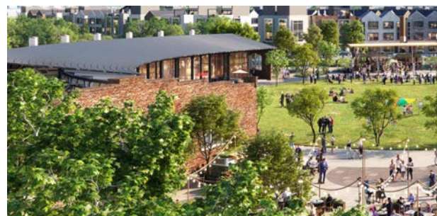
Schematic Design of Roundhouse Park

We look forward to welcoming both current and new Brisbane residents to Roundhouse Park. To learn more about The Baylands Specific Plan, please visit the City's website, www.brisbaneca.org/baylands . To keep up to date on The Bayland's development, check out our website, www.thebaylands.org .