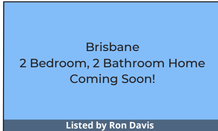
Brisbane 2 Bedroom, 2 Bathroom Home Coming Soon!