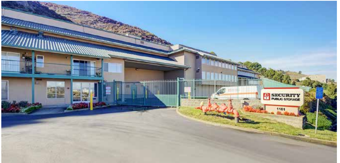
Security Public Storage at 1101 Carter Street in Daly City