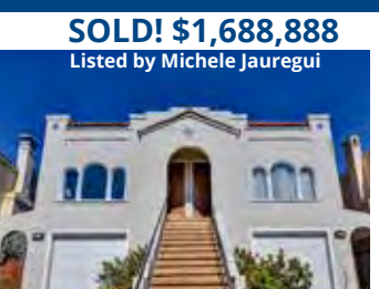
617 Spruce Ave, South San Francisco 6 bd| 4 bth| 3,324 sq ft Duplex

971 Le Conte Ave, San Francisco 2 bd|1 bth| 841 sq ft Home