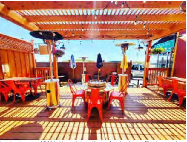
Facebook cover of 7 Mile House https://www.facebook.com/7milehousebar

Speaking of the new layout, 7 Mile House debuted expanded outdoor seating in 2020 along with a spacious patio