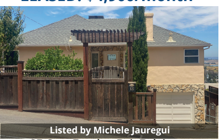
65 San Benito Rd, Brisbane 3 bd| 2 bth| 1849 sq ft Home

Thinking about Buying or Selling? Call us Today! We offer complimentary professional staging when you list with us! For more information visit VoyageRealEstateBrisbane.com