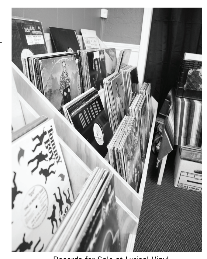
Records for Sale at Lyrical Vinyl

Got more tips? Or photos of DIY costumes or decorations? Please send them to <a href="info@ssfscavenger.com">info@ssfscavenger.com</a> so we can share with others.