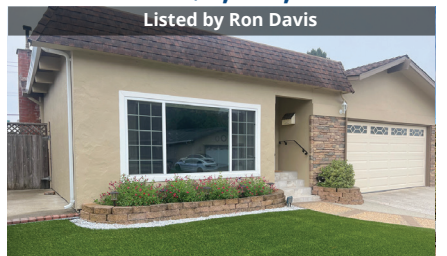
3430 Longview Dr, San Bruno 3 bd| 2 bth| 1870 sq ft Home