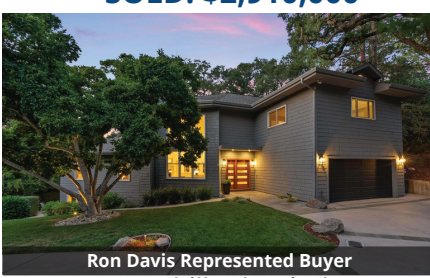
15 Overhill Rd, Orinda 5 bd| 3.5 bth| 3610 sq ft Home