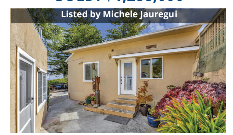
135 Humboldt Rd, Brisbane 2 bd| 2 bth| 970 sq ft Home + Bonus 1 bd unit