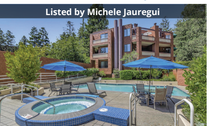
4250 El Camino Real D138, Palo Alto 2 bd| 1 bth| 885 sq ft Condo