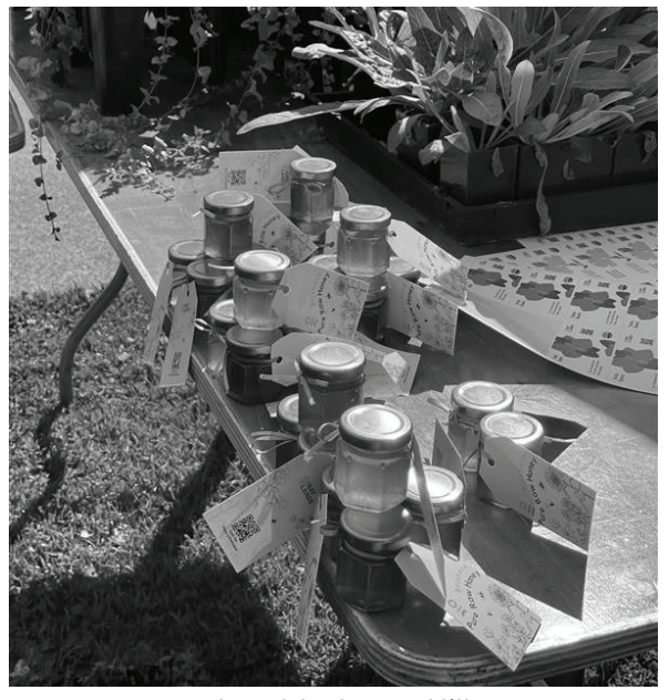
Local Icehouse Hill honey and local native plants.

As the sun set on this year's Day in the Park, BDI staff departed with tons of gratitude for the community's warm embrace. For details on the project's Specific Plan and planning process visit the City's website at <a href="mailto:brisbaneca.org/Baylands">brisbaneca.org/Baylands</a>, and to explore more details about The Baylands visit our website at <a href="mailto:thebaylands.com">thebaylands.com</a>.