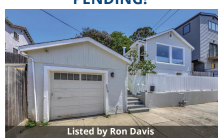
239 Santa Clara St, Brisbane 2 bd| 2 bth| 930 sq ft Home